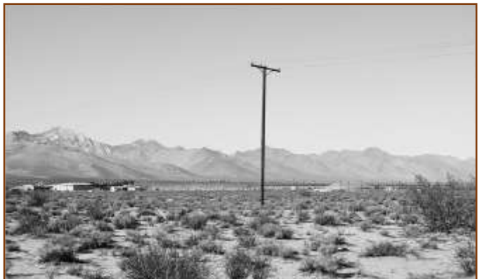
Inyo-Kern Company Building, c. 2013