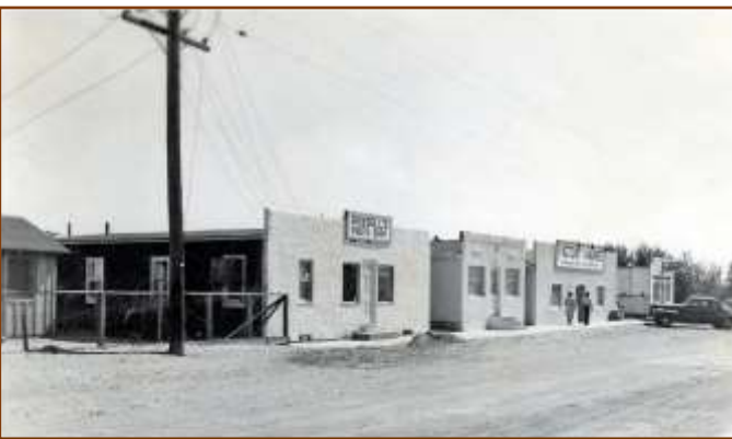
West Ridgecrest Boulevard, (Maturango Museum, 1946)