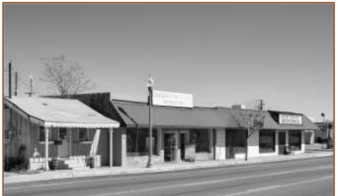
West Ridgecrest Boulevard, 2019