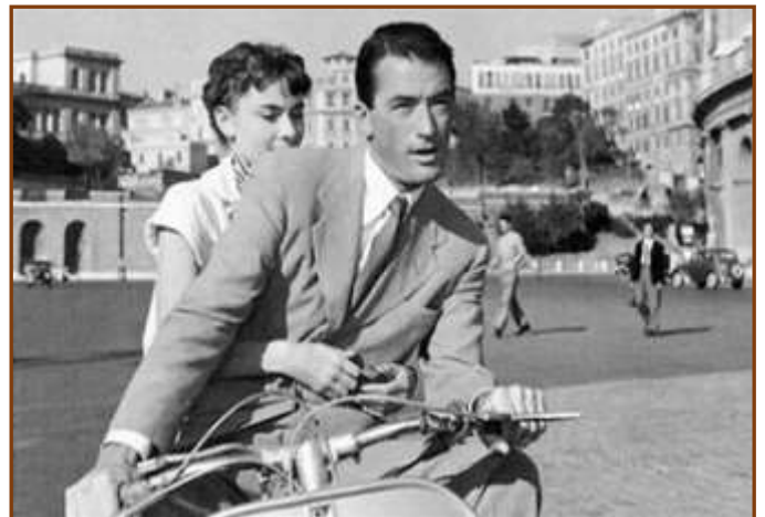
Gregory Peck and Audrey Hepburn star in our Grand Re-opening Classic Movie Night presentation on Wednesday, September 15 at 7:00 p.m.

Welcome Back to all the events that make the Historic USO Building the community jewel that it is! —Nick Rogers