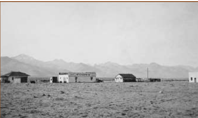
Inyo-Kern Company Building, c. 1925

has expanded to High Desert Double Exposures: A Photographic Retrospective of Ridgecrest and Its Neighbors . The result is a fascinating collection of photos showing how various locations in Ridgecrest and nearby spots in the Upper Mojave Desert region have changed over the years. Almost all are in a series of three or more shots, one showing an early view, then one taken for the original volume showing the identical site in 1988, and then more pictures showing the view today as well as usually a shot or two from the intermediate years. The photos are all accompanied by commentaries by Don or Liz giving the historical background and the contemporary reality of each scene.